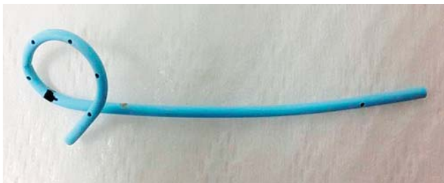
Fig. 4 The 5-Fr, 5-cm plastic pancreatic stent following its successful removal.