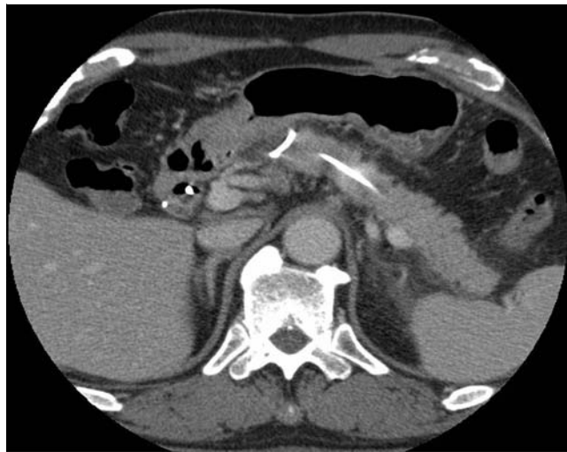
Fig. 2 Computed tomography (CT) image showing the proximally migrated pancreatic stent with its pigtail end impacted in a branch of the pancreatic duct.