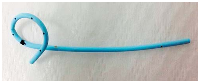
Fig. 4 The 5-Fr, 5-cm plastic pancreatic stent following its successful removal.