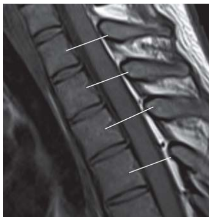
Fig. 1 Sagittal gradient echo magnetic resonance image (MRI) of the cervico-thoracic junction. Measurement lines were placed on each segmental level.

Spinal cord motion during breath-holding was highest at the levels of the first and second thoracic vertebral bodies (means, 0.29 mm and 0.28 mm, respectively).