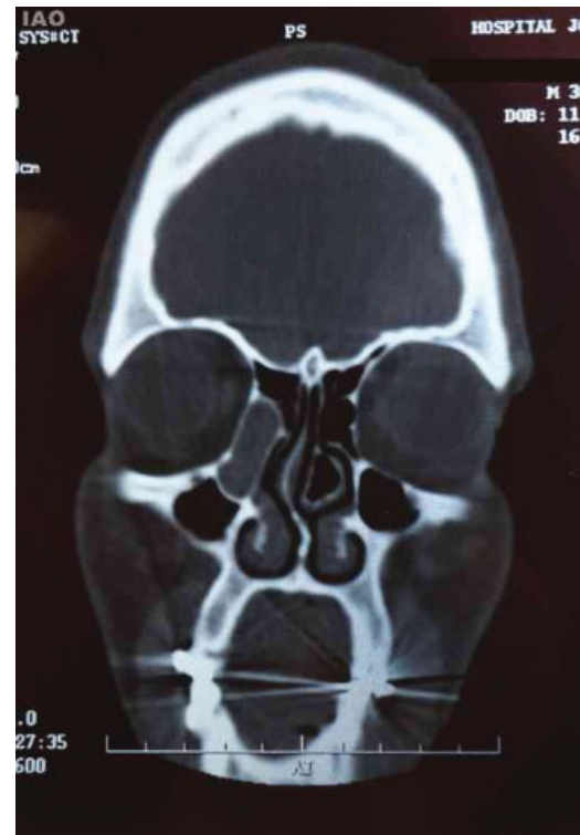
Fig. 2 Computed tomography of the paranasal sinuses, coronal section, in bone window, showing hypodense cystic lesion in the right nasolacrimal duct topography.

in blockage in the distal end of the nasolacrimal system, at the Hasner valve level, although the blockage can also occur at the lacrimal spot. 2,3,5