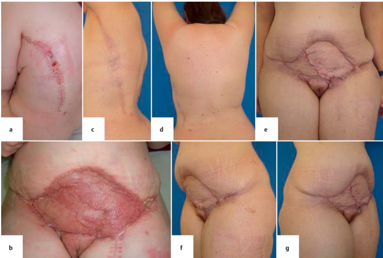
Fig. 3a to g a Wound healing disorder at the harvesting site of the latissimus dorsi flap around 4 weeks after surgery. b Earlier local findings around 4 weeks after surgery after removing the monitoring island with a small wound healing disorder located laterally on the left side. c Healed harvesting site of the latissimus dorsi flap 10 months after surgery. d The patient experiences

b Defect coverage with free myocutaneous latissimus dorsi flap and microsurgical end-to-side arterial anastomosis to the femoral artery and a coupler for venous anastomosis to the left great saphenous vein. The muscle flap was covered by meshed split-thickness skin graft from the thigh. A skin island to monitor perfusion was temporarily sewn on.