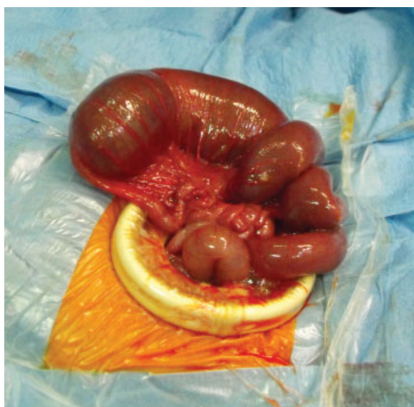
Fig. 2 Case of high jejunal atresia with multiple atresia.

Of the eight patients, four were female and four were male with a ratio of 1:1. All patients were premature babies with a