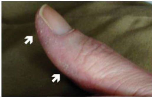
Fig. 1 Clinical features associated with antisynthetase syndrome include mechanics hands which present as hyperkeratosis (white arrows) and cracking at the tips of the fingers and along the lateral aspects of the fingers.