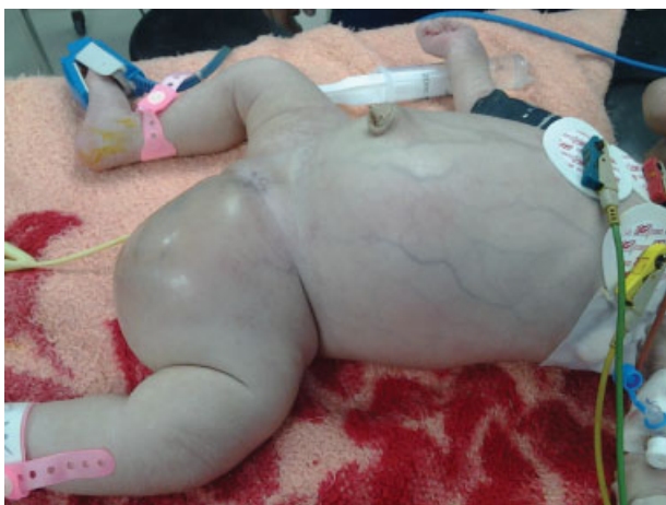
Fig.2 Preoperative clinical assessment of the patient.

The abnormal behavior related to the extension into the thigh in our case suggests that the tumor probably originated from the iliopsoas muscle, given its pelvic origin and lower limb insertion with passage under inguinal ligament. This behavior in neonates is rarely noted in literature, although a similar case was operated upon for a primary paratesticular tumor in a 13-year-old boy. 4 Approximately, half of neonatal RMS arise in the bladder, vagina, testicular, and sacrococcygeal regions. 5 In a multi-institutional Children's Cancer Group (CCG) study reported in 1995, a common characteristic of neonatal RMS was its aggressive biological behavior as half of the patients had widespread disease at the time of diagnosis. 6