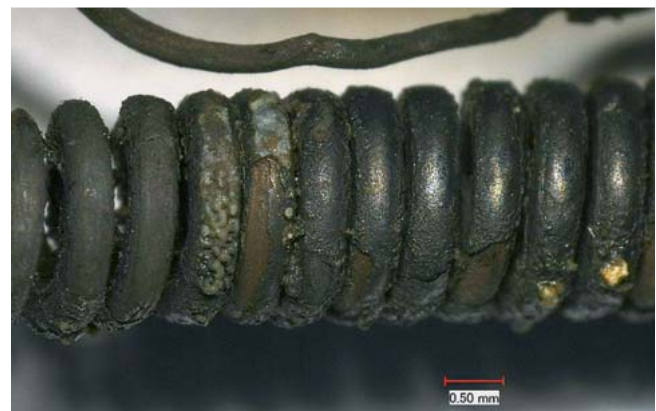
Fig. 3 The surface of the Gräfenberg ring (× 50).