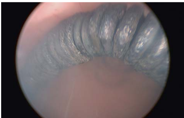
Fig. 2 Gräfenberg ring in utero (hysteroscopic recording).