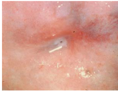
Fig. 4 Adequate conditions for colposcopic assessment, transformation zone type 3; only limited assessment of the transformation zone is possible.

Three different types of excision are mentioned in the addendum to the nomenclature, which also included for the first time the dimensions of excision specimens. The excision types link the different transformation types to clinical practice; the aim is to replace the continued use of a wide range of excision terms by descriptions of the types of excision performed and not the methods used for excision.