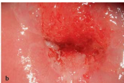
Fig. 3a and b Adequate conditions for colposcopic assessment, transformation zone type 2.