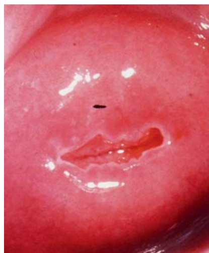
Fig. 2 Adequate conditions for colposcopic assessment, transformation zone type 1.

In the authors' opinion, this is a welcome step as it simplifies individualized planning and implementation of treatment. See also various publications on this point (e.g. Kühn 2011 [7], Reich & Fritsch 2014 [9]). Overall, the new colposcopy nomenclature emphasizes the significance of colposcopic investigations more than the preceding version did.