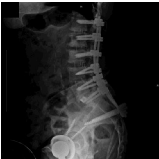
Fig. 10 A 2.5-week lateral X-ray image post emergent surgery.

In addition, there have been multiple studies correlating the usage of recombinant human bone morphogenetic