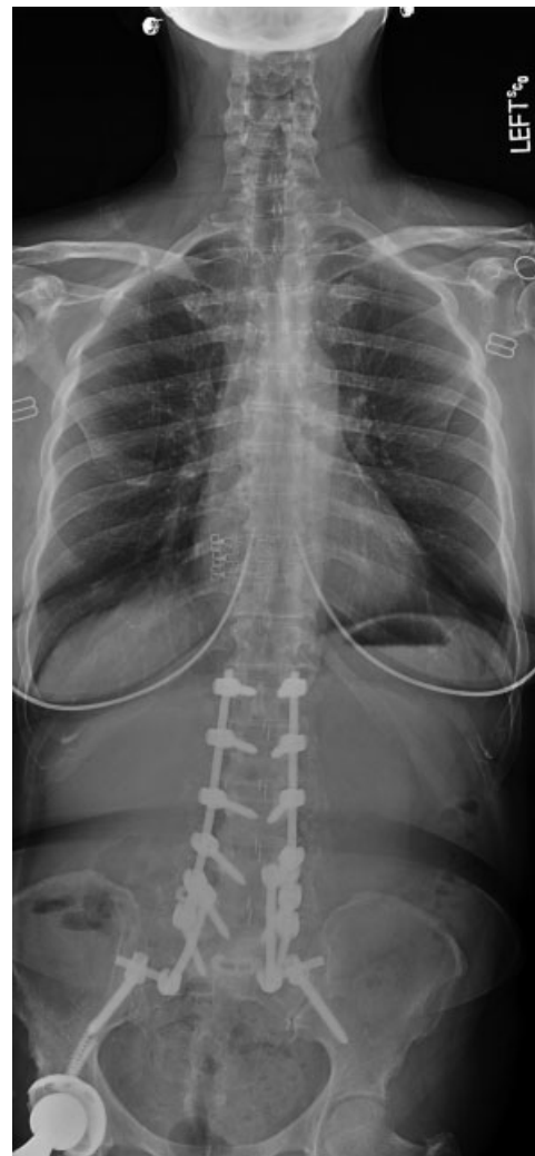
Fig. 12 A 6-month scoliosis anteroposterior image.