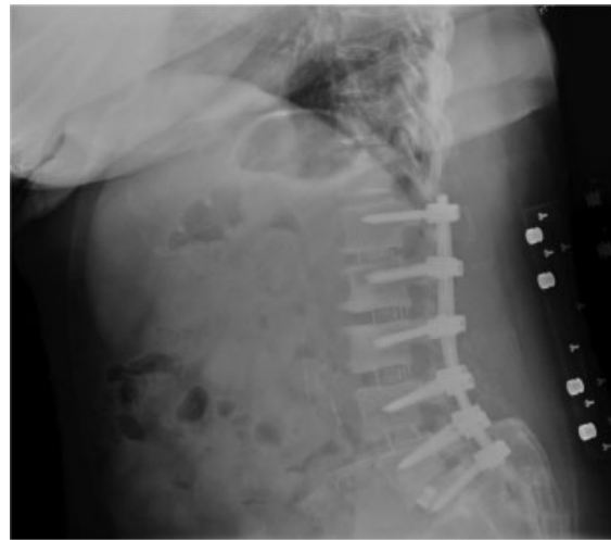
Fig. 5 A 2.5-week lateral X-ray image.

Abbreviations: BMI, body mass index; rhBMP-2, recombinant human bone morphogenetic protein.