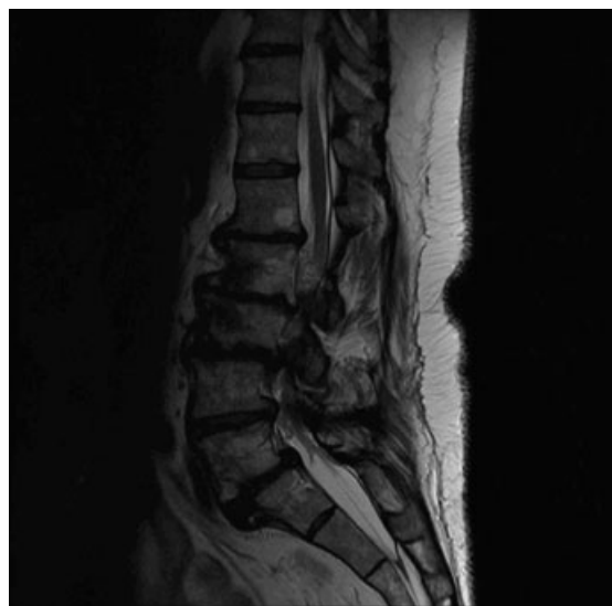
Fig. 3 Preoperative magnetic resonance imaging of sagittal plane.

S1, degenerative scoliosis from L1 to S1, and type 1, grade 1 spondylolisthesis from L5 to S1. Preoperative X-ray and MRI images are shown in ►Figs. 1 to 4. The confounding variables considered include age, levels operated on, estimated blood loss, drain usage, and BMI shown in ►Table 1.