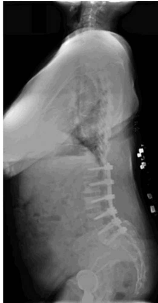
Fig. 7 A 6-week lateral X-ray image.

Despite the sterility of the seroma formed, its persistency can cause significant complications and pain for the patient due to pressure being exerted onto the thecal sac. It is thought that seroma formation may be due to a local inflammatory response, or the presence of foreign bodies; however, the exact causation of its formation is unknown. 3 The recurrent