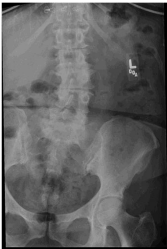
Fig. 1 Preoperative X-ray image of coronal plane.

S1, degenerative scoliosis from L1 to S1, and type 1, grade 1 spondylolisthesis from L5 to S1. Preoperative X-ray and MRI images are shown in ►Figs. 1 to 4. The confounding variables considered include age, levels operated on, estimated blood loss, drain usage, and BMI shown in ►Table 1.