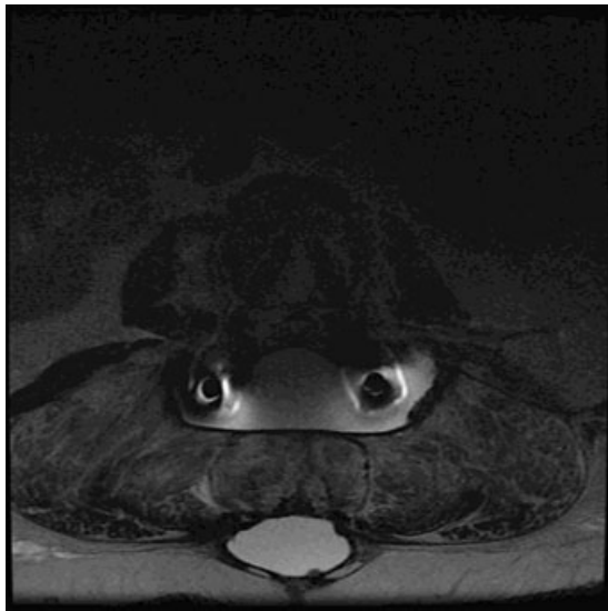
Fig. 9 A 6-week magnetic resonance imaging of transverse plane.