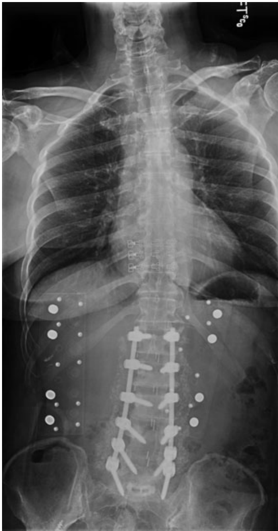
Fig. 6 A 6-week scoliosis anteroposterior image.

without back or leg pain, and remained afebrile. The patient had routine laboratories performed with normal complete blood count values and erythrocyte sedimentation rate of 25 mm/h. The results were all reasonable levels, and presented no unusual findings. This accumulation of fluid required aspiration a total of eight additional times within 3 months of the revision surgery. Following each of multiple aspirations, the fluid was cultured and sent to microbiology yielding the same results showing no infection. Initially, a total of 60 mL of fluid was aspirated. This decreased during each aspiration to a final amount of 10 mL at the last aspiration. The spacing between the times of drainage was initially every week, slowly increasing in time to drainage every 2 to 3 weeks.