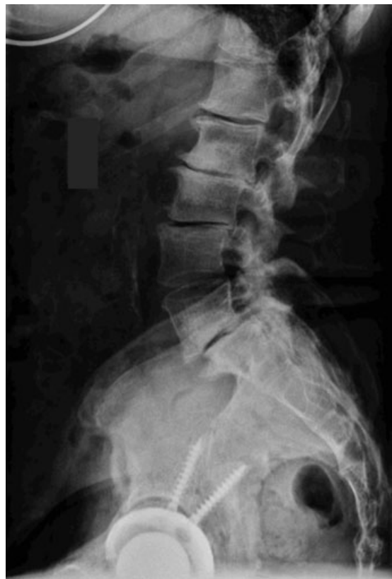
Fig. 2 Preoperative lateral X-ray image.

A 59-year-old female patient with a height of 5'6 and body mass index (BMI) of 27.1. The initial symptoms included lower back pain with bilateral leg pain, neurogenic claudication, as well as weakness in her right lower extremity (L3–L5 distribution). Previous X-rays and magnetic resonance imaging (MRI) showed degenerative scoliosis of the lumbar spine, grade 1 hypermobile anterolisthesis of L5 on S1, severe disc collapse at L5–S1, vacuum disc phenomenon at L2–L3, focal retrolisthesis at L2–L3, spondylosis from L2–S1, and severe spinal stenosis from L2–S1. Nonoperative efforts were exhausted primarily, followed by the recommendation for surgical intervention. The preoperative diagnosis was lumbar spondylosis at L1–S1, stenosis with neurogenic claudication, bilateral radicular features and neurologic deficit from L2 to