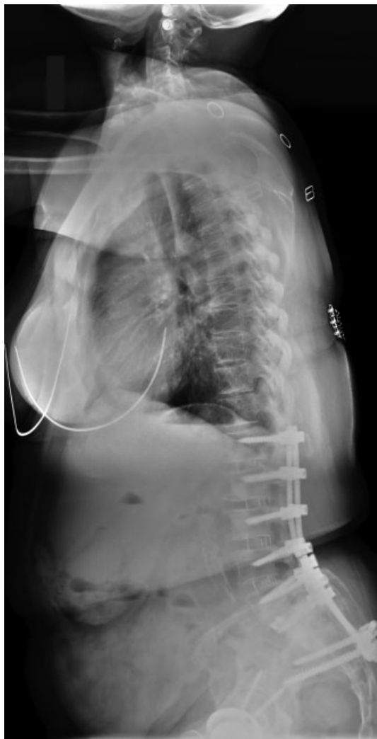
Fig. 13 A 6-month lateral X-ray image.

protein (rhBMP)-2 with the formation of a postoperative sterile seroma. 3,8 It has been hypothesized that rhBMP-2 correlates with a higher rate of seroma formation due to the propensity for rhBMP-2 to cause inflammation. Repeat usage of rhBMP-2 has also been associated with seroma formation, which suggested a relationship to antibody formation. 3 This patient, however, received no rhBMP-2 to facilitate fusion. With few confounding variables to account for (► Table 1 ), the causation of the recurring sterile seroma is still irresolute.