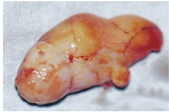
Fig. 2 Totally excised mass.

HP symptoms depend on the size and location of the lesion. 18 The most common symptoms of HP in the oronasopharynx may include rhinorrhea, recurrent cough, failure to gain weight, snoring, and sleep apnea during infancy 2-4 ; however, the latter two symptoms, although they might be life-threatening, have rarely been reported in the clinical presenta-