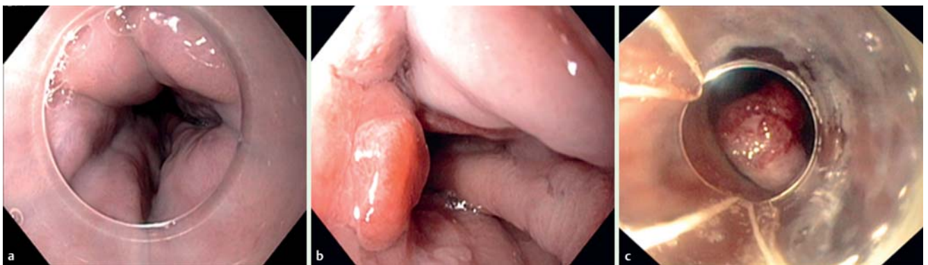
Fig. 1 Endoscopic images of patient 2. a Esophageal varices, grade II. b An early adenocarcinoma. c The lesion after placement of a rubber band. In this case, snaring of the lesion would have led to severe bleeding and was therefore omitted.

would enable direct variceal ligation in case of bleeding. The resection was uneventful, and histopathological examination showed an intramucosal adenocarcinoma. At 2 months, a recurrent neoplastic lesion was observed (Paris 0-IIa) at the exact location of the previous resection. This lesion was captured by means of one rubber band by which not only the lesion but also the underlying varix was ligated; however snaring was omitted since this would have led to a massive variceal bleed. During 4.5 years of follow-up, no recurrence was detected. Patient 2 (a 50-year-old man) had short-segment Barrett esophagus, a Paris 0-IIa+