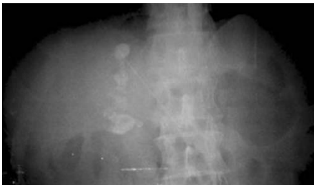
Fig. 2 Abdominal radiograph showing the location and occlusion of the varices after their injection with a mixture of cyanoacrylate and Lipiodol.