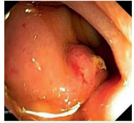
Fig. 3 Follow-up endoscopy 2 weeks later showing obliteration of the ectopic varices.

Ectopic variceal bleeding is a rare cause of gastrointestinal hemorrhage, representing up to 5% of all variceal bleeding episodes [1]. The most common cause of ectopic variceal bleeding is portal hypertension (from both intrahepatic and extrahepatic causes) [2]. In the absence of portal hypertension, other causes may include abdominal surgery, abnormalities in the venous outflow vessels, abdominal vascular thrombosis, hepatocellular carcinoma, pancreatitis, and familial syndromes [2,3]. Ectopic variceal bleeding can pose a diagnostic dilemma and endoscopy plays a major role in the diagnosis and treatment of this condition.