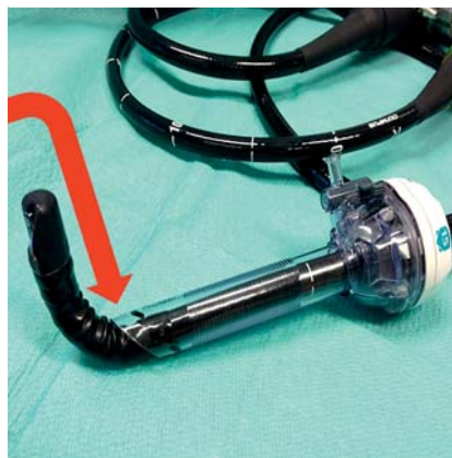
Fig. 3 Retraction of an angulated duodenoscope can result in “peeling” of the coating of the endoscope (arrow).

A particular disadvantage of the LA-ERCP technique is the requirement for a repeat hybrid laparo-endoscopic access to the upper quadrant when repeat ERCP is required, for instance, to manage post-sphincterotomy bleeding or residual CBD stones. When the need for repeat ERCP is anticipated during the first LA-ERCP procedure, a gastrostomy tube can be inserted through