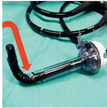
Fig. 3 Retraction of an angulated duodenoscope can result in “peeling” of the coating of the endoscope (arrow).

A particular disadvantage of the LA-ERCP technique is the requirement for a repeat hybrid laparo-endoscopic access to the upper quadrant when repeat ERCP is required, for instance, to manage post-sphincterotomy bleeding or residual CBD stones. When the need for repeat ERCP is anticipated during the first LA-ERCP procedure, a gastrotomy tube can be inserted through