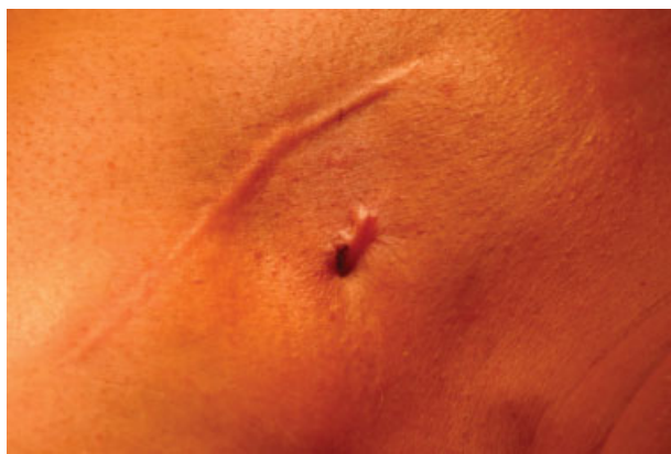
Fig. 1 In addition to the scar of the old permanent pacemaker pocket the ulceration of the fistula is obvious.

adhesions, a further supraclavicular incision was necessary to reach the fragment (→ Fig. 3 ). Another advantage of the additional supraclavicular incision was facilitated access to the lead remnant and better control in case of hemorrhagic complications. In addition, the strong connective tissue of the fistula served as a guidance structure to reach and mobilize the fistula and the lead fragment. We were able to rescue a 10 cm lead isolation fragment, the anchor, and the electrode tip of the pacemaker lead explanted 6 years ago (→ Fig. 4 ). This finding was unexpected, because the silicone insulation of the pacing lead was invisible under fluoroscopy and we had assumed only a lead tip or a small fragment. The fistula ended right on the subclavian vein. To prevent oozing, we placed a Tabotamp hemostat (TABOTAMP, Ethicon Biosurgery, Johnson & Johnson Medical GmbH, Norderstedt, Germany), a densely woven knit of oxidized regenerated cellulose, inside