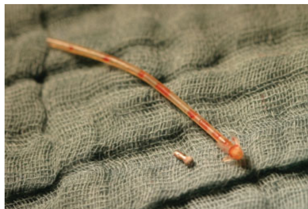
Fig. 4 The removed lead remnant and electrode tip.

The removal of implanted PPM and pacemaker leads in case of endocarditis is recommended by professional societies and expert panels. The described mortality for the complete removal is low in centers with extensive experience and reinfection is rarely observed. 4-6 A prerequisite for a successful therapy, however, is the complete removal of all prosthetic material. In addition, infective remnants may complicate the implantation of a PPM on the contralateral side and may cause reinfection of the new system. 7,8 Nevertheless, a reinfection 6 years following initial surgery is in our experience unique. In the described case it was concluded that a complete removal of inactive or infected leads is necessary. A high success rate requires that the surgeon or cardiologist has a lot