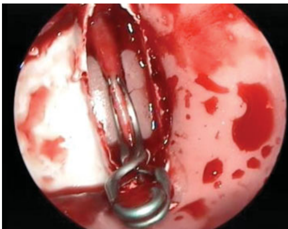
Fig. 3 T2 aneurysm clip (Mizuho, Tokyo, Japan) placement on carotid injury site.

Bipolar electrocauterization has also been described 2 ; however, long-term outcomes in a clinical setting are unknown. Padhye et al trialed bipolar electrocauterization on