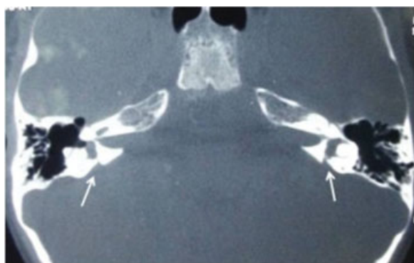
Fig. 2 Computed tomography scan of case 2 showing large vestibular aqueduct.

A boy 5 years and 9 months old born from consanguineous parents presented to our Implant Outpatient Department with a history of hearing problems noticed by the parents at the age of around 12 months, when the child had not developed speech and language. Antenatal, natal, and post-natal history was normal, as well as family history. His other developmental milestones were within normal limits. He was also assessed by the ENT consultant, audiologist, psychologist, and speech therapist. The entire audiological package