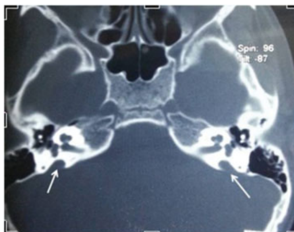
Fig. 3 Computed tomography scan of case 3 showing bilateral large vestibular aqueduct.

A girl 4 years and 8 months old was referred from Deaf Screening camp organized in a remote area of Tamil Nadu, India. According to her parents, she did not respond to sound since early childhood and not developed speech and language even after use of hearing aids. She was admitted to a deaf school in the village. She had an uneventful pre- and postnatal period and a birth weight of 3.5 kg. The parents had a history of consanguineous marriage. She was also assessed preoperatively, as in case 1, and the reports were similar, confirming cochlear hearing loss. Temporal bone CT scan evidenced LVA (1.9 mm) on both sides (►Fig. 3). She also received her implant in the right ear. In this case also a pulsatile RW could clearly be noticed after exposing the RW via standard transmastoid facial recess approach, but the pulsatile stapes sign was not obvious even after dislocating the I-S joint. An incision was made on the RW membrane. Immediately after the puncture, CSF started leaking in a pulsatile manner. After elevating the head end of the operating table, the gusher decreased significantly. Within a few minutes, the CSF gusher was well controlled without a mannitol drip. Then electrode array was inserted via the RM. The last two pairs of electrodes could not be inserted as a resistance could be felt at the end. Temporalis muscle fascia was used to seal the fenestrum