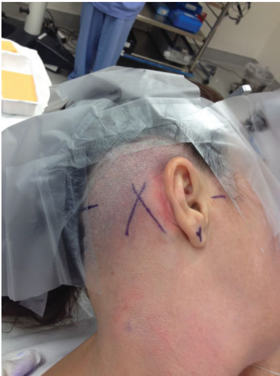
Fig. 3 Preoperative view of skin markings prior to incision. Posteriorly, the external occipital protuberance has been marked with a horizontal line. The estimated location of the sigmoid sinus has also been marked with a crossing line that delineates the patient's hairline. Anteriorly, the root of the zygoma has been marked with a horizontal line.

protuberance. The sigmoid sinus is then approximated parallel and lateral to the posterior mastoid groove (► Fig. 3 ). The incision is then marked over the intersection of these two lines, parallel to the hairline. Facial nerve monitoring and brainstem auditory evoked response are routinely used for monitoring, eliminating the possibility of paralytic use by anesthesia.