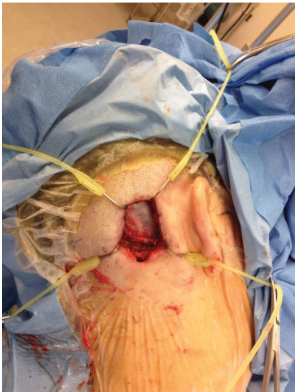
Fig. 6 View of craniectomy defect filled in with hydroxyapatite bone cement.

The mean tumor size at the time of surgery was 1.5 cm (range: 1.0–2.0 cm). All 12 patients (100%) underwent successful