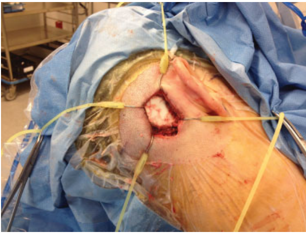
Fig. 7 Operative setup with the holding arm arching over the patient and rigidly holding the endoscope in place. Note how the surgeon is able to operate with bimanual dexterity while still maintaining optimal visualization.

1/6 postoperatively, demonstrating excellent facial nerve preservation. In addition, a hearing preservation rate of 67% is similar or better than most literature to date.