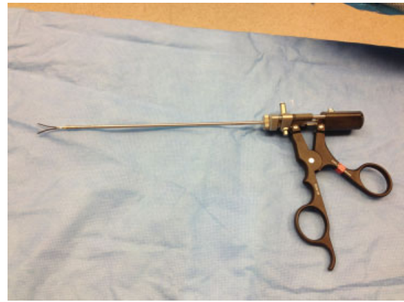
Fig. 8 Pistol-gripped bipolar that has replaced the bayonet-style traditional bipolar.

Despite its advantages, limitations do exist in the purely endoscopic approach. Preoperative imaging must be carefully reviewed to ensure that the prepontine or interpeduncular cisterns are present. Drainage of these cisterns during surgery is key to obtain appropriate cerebellar relaxation, without which visualization is significantly limited. Heat from the endoscopic light source has the potential to cause thermal damage to surrounding structures, creating a significant hazard. To avoid this, we utilize a thin sleeve over the endoscope and intermittent irrigation to control high temperatures. Instrumentation is another struggle to overcome. The small working corridor that exists between the cerebellum and petrous temporal bone makes using the traditional bayonet-style instruments difficult, if not impossible. Instead, we use a separate instrument set that is based on a rotational pistol-grip style (—Fig. 8). More recently, significant improvements in tumor aspirators and drilling systems designed specifically for endoscopic approaches have further improved tumor resections in the CPA. Most of these challenges can be easily overcome with proper preparation, but the main obstacle most skull base surgeons face is the steep learning curve required for posterolateral endoscopy. The endoscope forces surgeons to work in parallel to the endoscope, rather than the traditional manner of working in series along the