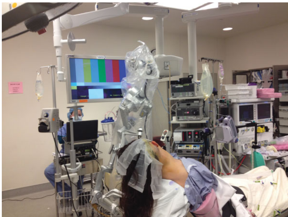
Fig. 2 Preoperative setup with the patient in the appropriate position. The holding arm is mounted to the bed on the contralateral side, and the high-definition monitor is directly behind it.

patient, in a direct line-of-sight from where the primary surgeon stands, allowing for appropriate visualization without significant movement (→ Fig. 2 ). Next the ipsilateral transverse sinus is approximated by drawing a line between the root of the zygoma and the external occipital