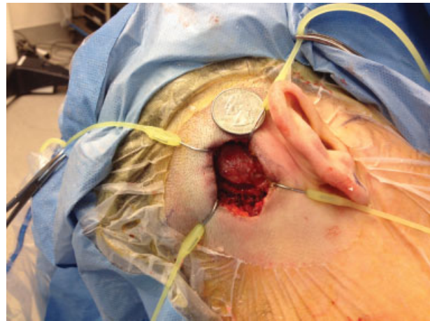
Fig. 4 Intraoperative view of the size of the retrosigmoid craniotomy. A U.S. quarter is placed just above the incision for reference size.

Once the dural flap is reflected medially and inferiorly, a 4-mm 0-degree endoscope, secured to the holding arm, is introduced and advanced in the corridor between the