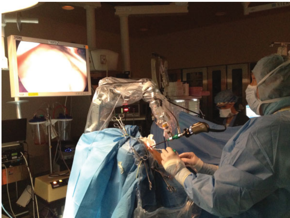
Fig. 5 View of dural closure with dural onlay graft.

schwannoma. Eight patients were male; four were female. All tumors were unilateral with five on the right side and seven on the left side. The mean age at the time of surgery was 46.7 years (range: 28–68 years). The most common presenting