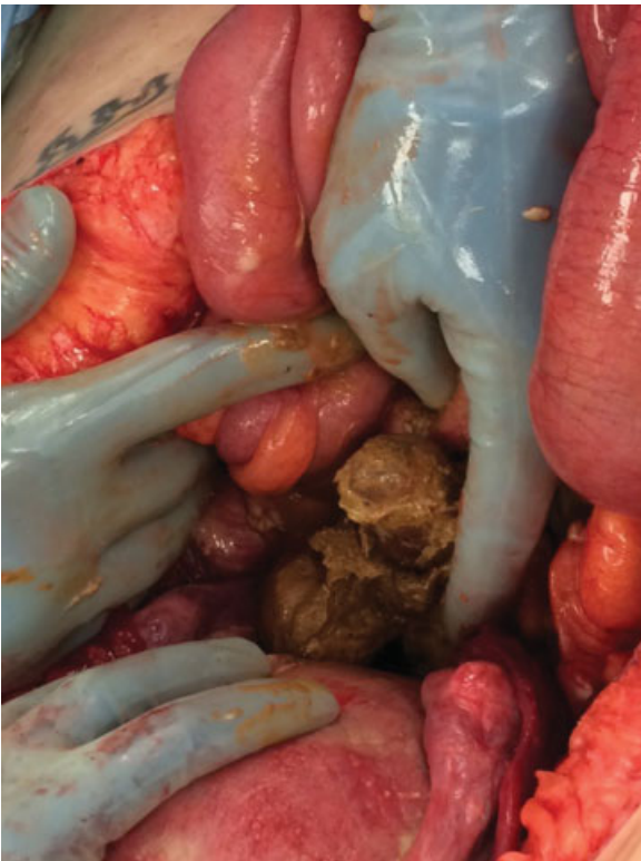
Fig. 3 Intraoperative findings: Feculent peritonitis with white fibrous adhesions were noted on the small bowel and the posterior uterus. Multiple dilated loops of bowel were encountered.

the high risk for sepsis due to the finding of feculent material in the peritoneal cavity and the difficulty in performing a colonic resection in the setting of a gravid uterus, the decision was made to perform a repeat low transverse cesarean section. A sigmoid colectomy with descending end colostomy was then performed, the abdomen was copiously irrigated and the fascia was closed, but the skin was left open with application of negative wound therapy. The infant's Apgar score was 5 at 1 minute and 7 at 5 minutes with a pH of 7.11 and base excess of -8 mmol/L. Pathologic evaluation of the wall of the resected sigmoid colon showed acute inflammation with a 6\text{ cm} \times 5\text{ cm} perforation ( Fig. 4 ). Placental pathology was unremarkable.