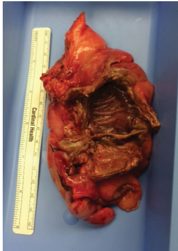
Fig. 4 Sigmoid colon: Gross pathologic specimen showing an ovoid perforation of the sigmoid colon measuring approximately 6\text{ cm} \times 4\text{ cm} , consistent with stercoral perforation.

The patient's postoperative course was complicated by an intra-abdominal abscess and fascial dehiscence. On postoperative day 6, interventional radiology attempted computed tomography (CT)-guided abscess drainage, but ultimately on postoperative day 8 she returned to the operating room for repeat exploratory laparotomy, wash-out, and fascial closure with a monofilament synthetic absorbable suture. She was discharged home on postoperative day 25 afebrile, normotensive, nontachycardic, with a patent and productive stoma. The infant by the 2nd postoperative day was stable on room air and was tolerating tube feeds. She was given a prophylactic course of antibiotics given the maternal sepsis, but the infant was without evidence of infection. The infant is planned to be discharged at approximately 5 weeks of life.