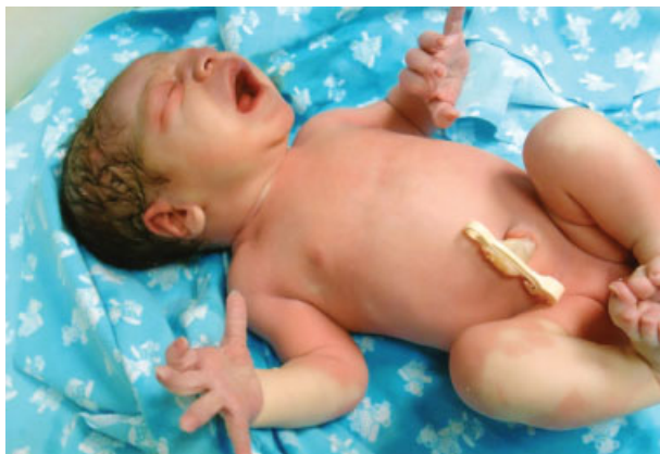
Fig. 2 Harlequin phenomenon in a Moroccan preterm newborn (31 weeks' gestational age). Regional, clear-cut edge skin discoloration started 10 minutes after delivery during intense crying, involving face and right hemibody of the neonate, and vanished minutes after.

A term, healthy neonate developed an altered color of the right hemiscrotum soon after a bath (► Fig. 3 ); no other body region was interested in the phenomenon, which quickly regressed in about 1 minute leaving no trace.