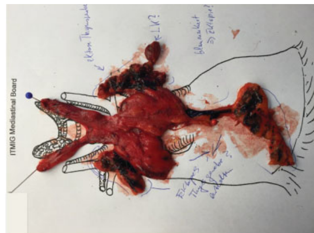
Fig. 3 Specimen prepared for histological work-up and for analysis of ectopic thymic tissue.

capsule, are gently grasped and then pulled down. Patience is important during complete mobilization of each upper pole. At the cranial end, the thyrothymic ligament becomes clearly visible, and under tension of the completely exposed upper thymic pole, this ligament is severed by ultrasonic dissection or between clips. In most cases, the right phrenic nerve is now identified. Thymectomy concludes with preparation of the right thymic pole under CO 2 insufflation. The en bloc specimen of the thymus, including all surrounding fatty tissue, is placed in an endobag and removed through the middle trocar incisions. The specimen is measured by size and weight. Histological work-up is prepared by positioning the specimen as shown in Fig. 3 . A photodocumentation is added. The operative field, including the venous confluence, the supra-aortic arteries, and parts of the anterior tracheal wall, is examined for the presence of residual tissue and hemostasis. If the right pleural cavity is opened, an enlargement of this opening prevents a right postoperative pneumothorax. A