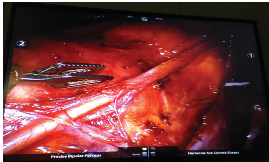
Fig. 2 Left-sided approach after robotic dissection for ectopic thymic tissue in the aortopulmonary window.