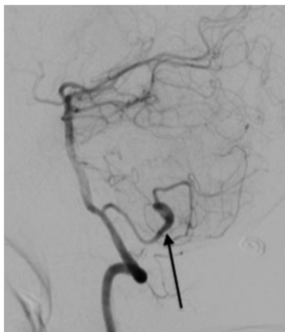
Fig. 2 Digital subtraction angiogram in the sagittal projection obtained following contrast injection into the left vertebral artery confirmed a partially thrombosed dolichoectatic aneurysm of the left distal posterior inferior cerebellar artery (arrow).

There are numerous causes of IH. Most are due to gastric distention and/or gastroesophageal reflux. 2 IH occurring with systemic illnesses such as sepsis or uremia have been described, in addition to psychiatric disorders such as hysteria, anorexia, or grief. 4 Infrequently, a peripheral nervous system cause of IH is possible as the result of irritation along the hiccup reflex arch including the thoracic sympathetic chain, phrenic nerve, or accessory respiratory musculature. 1 Even more rare are lesions of the central nervous system that occur as the result of an insult to the “hiccup center” in the medulla oblongata. 6 Ischemia