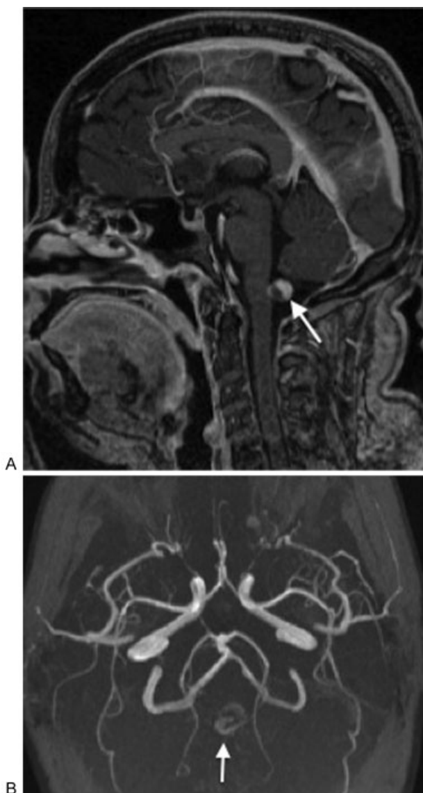
Fig. 1 (A) Sagittal contrast-enhanced magnetic resonance imaging and (B) axial magnetic resonance angiogram of the brain demonstrate a partially thrombosed posterior inferior cerebellar artery aneurysm within the fourth ventricle (arrows).