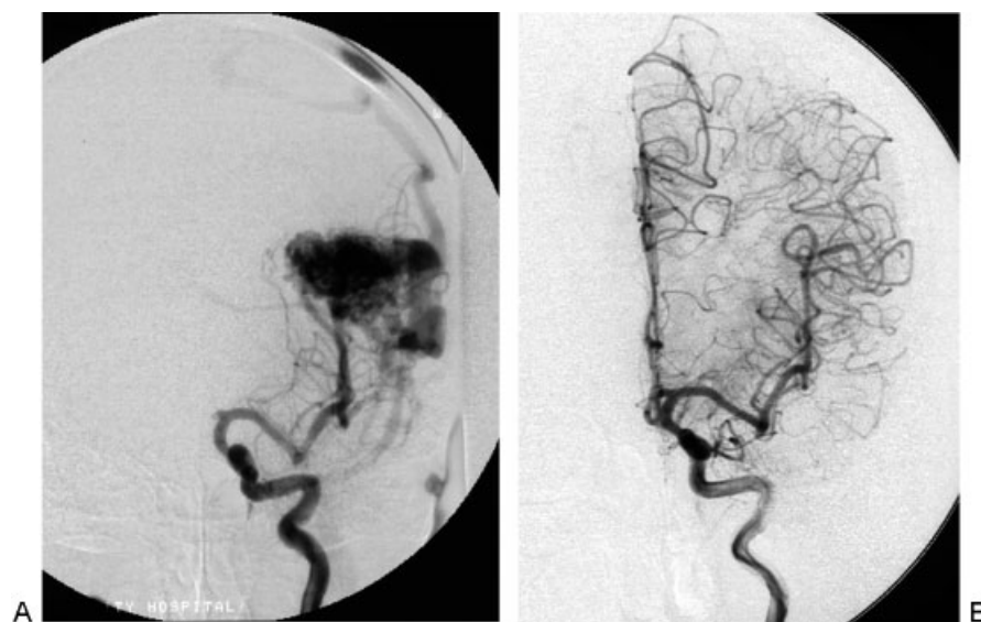
Fig. 2 (A) The anteroposterior image of the left internal carotid angiogram prior to the first radiosurgery showed an arteriovenous malformation fed by the middle cerebral artery and drained into the superior sagittal sinus. (B) The left internal carotid angiogram 3 years after the second radiosurgery showed complete eradication of the shunt flow.

Stereotactic radiosurgery is purported to be a less invasive procedure for vascular malformations and central nervous