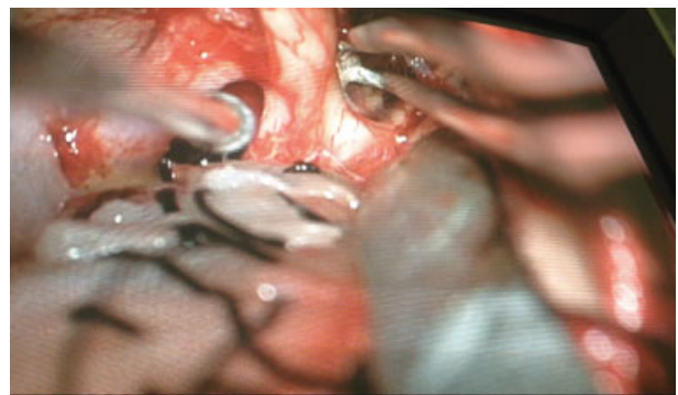
Fig. 5 Intraoperative use of angled microtip bipolar (45 degrees upward) in case described in Fig. 4 resulted in optimal access, easy coagulation, and even grasping and removal of the tumor around the left optic nerve (the suction tip shows left optic-carotid recess).