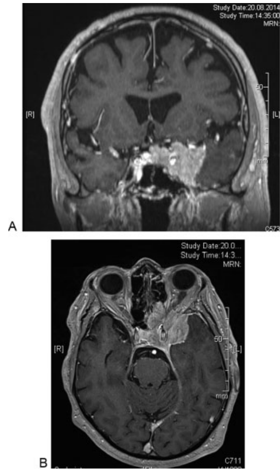
Fig. 4 Preoperative (A) coronal and (B) axial magnetic resonance imaging (with contrast) of a patient with left-sided medial sphenoid wing meningioma with extension to the orbital, sellar, and ethmoidal region as well as involvement of the cavernous sinus.