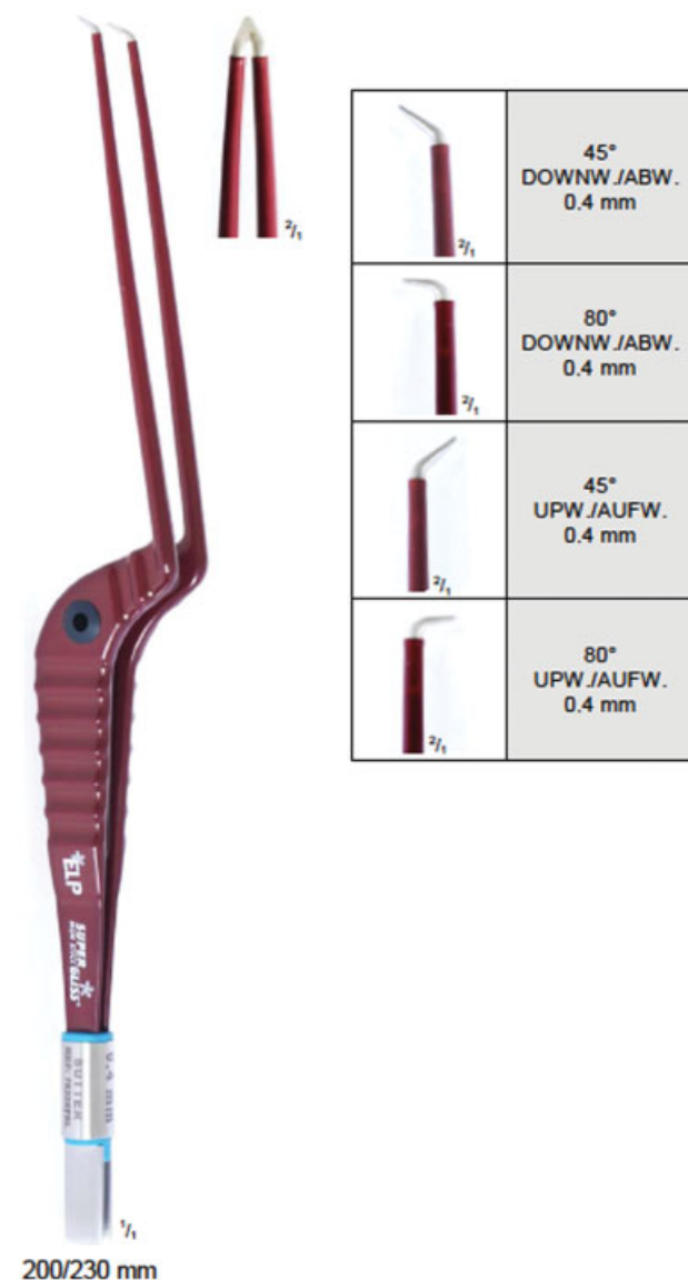
Fig. 1 The multi-angle microbipolar designed in two different lengths of 200 mm and 230 mm. Each of the two lengths can have a 45- or an 80-degree angle upward and downward. UPW, upward; DOWNW, downward.

The newly designed microforceps have an outer diameter of 1.9 mm and come in two different lengths: 200 mm and 230 mm. Each of these lengths can have a 45-degree or an 80-degree microtip angled upward and downward (►Fig. 1) The new microforceps come in two microtip sizes: 2 mm for 45 degrees and 2.5 mm for 80 degrees (►Fig. 2A, B)