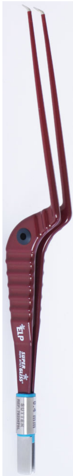
Fig. 3 The European model: 200 mm long, 45-degree angled microbipolar.