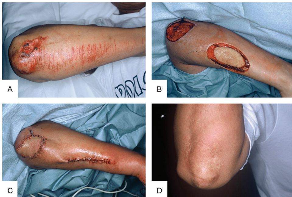
Fig. 2 (A–C) A skin and subskin soft tissue defect caused by injury was reconstructed with a venoneuro-accompanying artery fasciocutaneous flap (VNAF) containing the basilic vein. (D) Sensory switching was observed after 4 months.

A 75-year-old woman recognized small nodule on her right elbow. Biopsy was performed and sarcoma was suspected. After the tumor resection, the elbow was reconstructed with a VNAF flap containing the cephalic vein (► Fig. 3A–C). The