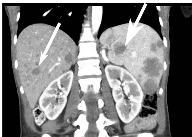
Fig. 1 Contrast-enhanced CT scan in longitudinal section reveals multiple hypodense lesions of the liver (small arrowhead) and spleen (large arrowhead).