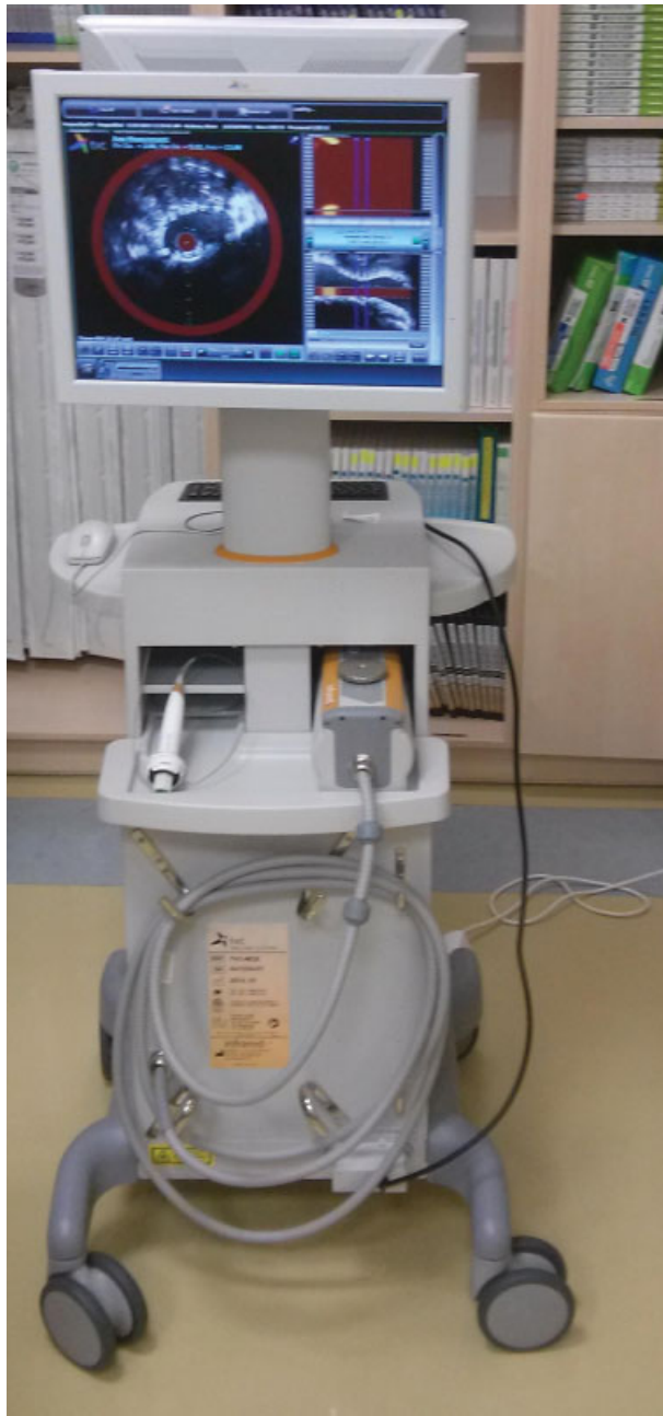
Fig. 1 The near infrared spectroscopy imaging device consisted of the following three main parts: a dual-modality 3.2 F imaging catheter that incorporates both near-infrared spectroscopy and intravascular ultrasound; a device for the mechanical pullback and rotation of the catheter through a vessel; and finally, a console with which one can observe the results of both imaging modalities in real time in the catheterization laboratory.

extreme of the scale is represented as yellow. The X-axis of the chemogram indicates the pullback position in millimeters, while the Y-axis represents the circumferential position in degrees, as though the coronary vessel has been incised along its longitudinal axis (→ Fig. 3). 25,26 The lipid-core burden index (LCBI) was established to satisfy the need for the quantification of the presence of lipids. The LCBI is defined as the proportion of yellow and red pixels on the