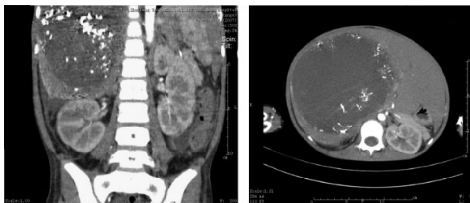
Fig. 2 The tumor shank 4 weeks after TACE of case 1. TACE, transarterial chemoembolization.

transient liver dysfunction including the rise of ALT (63 U/L) for 1 week, without cardiac, leukocytopenia, or renal dysfunction, and these symptoms showed dramatic improvement after symptomatic treatment. Four weeks after TACE, abdominal ultrasonography and CT scan showed that the tumor volume decreased by 31% and the blood flow of the tumor was clearly lower than before treatment (→Fig. 2).