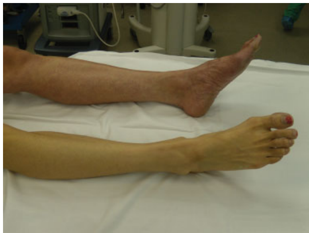
Fig. 1 Cyanosis of affected left limb.

Intraoperative duplex ultrasonography demonstrated marked dilatation of the left common femoral and external iliac vein. Additionally, the left popliteal and tibial veins were markedly dilated and noncompressible, suggesting extensive iliofemoral thrombosis. Phlegmasia cerulea dolens and May–Thurner syndrome were diagnosed. Given the extensive thrombus and severity of ischemia, the patient underwent four-compartment fasciotomy with left iliofemoral venous thromboembolectomy, left popliteal and tibial vein embolectomy, chemical and mechanical thrombolysis of left common iliac vein with a Trellis device, balloon angioplasty of the left common femoral vein, and placement of a left iliac vein stent (→ Fig. 2 ). At the completion of the procedure, the patient gained reestablishment of perfusion in the left lower extremity.