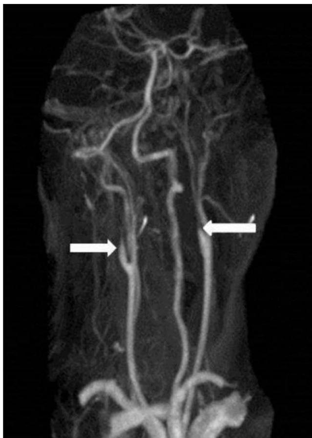
Fig. 1 Magnetic resonance cervical angiogram showing significant stenoses and near occlusion of both the internal carotid arteries from dissection. (white arrows).

TCCS controls showed the persistence of the initial values during all the acute period while ICA stayed occluded. Controls were implemented at 3, 6, 9 and 12 months. These findings were corroborated by a CT angiogram at 6 months. 3-year follow-up revealed no further clinical events, and the neurosonologic findings were unchanged.