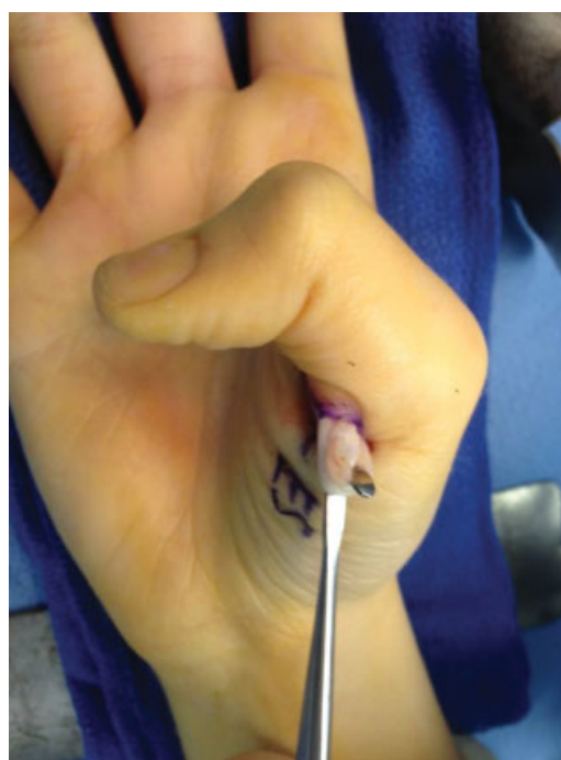
Fig. 1 Flexor tenosynovitis seen about the flexor pollicis longus (FPL) during trigger thumb surgery.