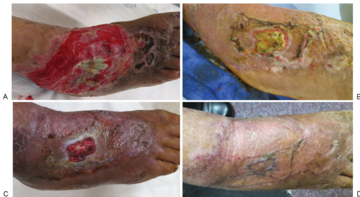
Fig. 1 A 37-year-old woman who was struck by a motor vehicle presented with a degloving injury of her right dorsal foot. (A) On initial referral, the patient had been treated three times with urinary bladder matrix, without coverage of her exposed extensor tendons. (B) Majority of the wound was successfully skin grafted except for central portion with exposed tendon. dHACM was applied once. (C) The wound demonstrated adequate granulation tissue 1 week later and she underwent STSG. (D) Stable closure 4 weeks following STSG.

A 64-year-old man presented with more than 20 years history of a draining midtibial wound following a motor vehicle collision. Comorbidities included diabetes, hyperlipidemia, hypertension, and chronic obstructive pulmonary disease. We performed wide soft tissue and bony debridement, resulting in 8 cm 2 of exposed tibia, placed dHACM, and started intravenous (IV) cefazolin (► Fig. 2 ). Three days after dHACM placement, bony cultures grew methicillin-resistant Staphylococcus aureus (MRSA) and switched to IV vancomycin. Notably, no clinical infection developed. Two additional dHACM treatments were applied, adequate granulation tissue developed, and STSG was successful. Of note, the superolateral corner of the wound was not treated with dHACM, resulting in persistently exposed tibia which was closed with