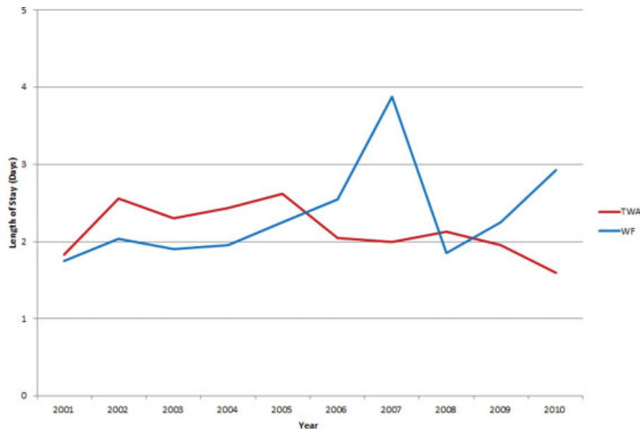
Fig. 3 Trends of length of stay for total wrist arthroplasty and wrist fusion from 2001 to 2010.