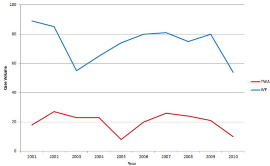
Fig. 1 National trends of volume of total wrist arthroplasty and total wrist fusion from 2001 to 2010.