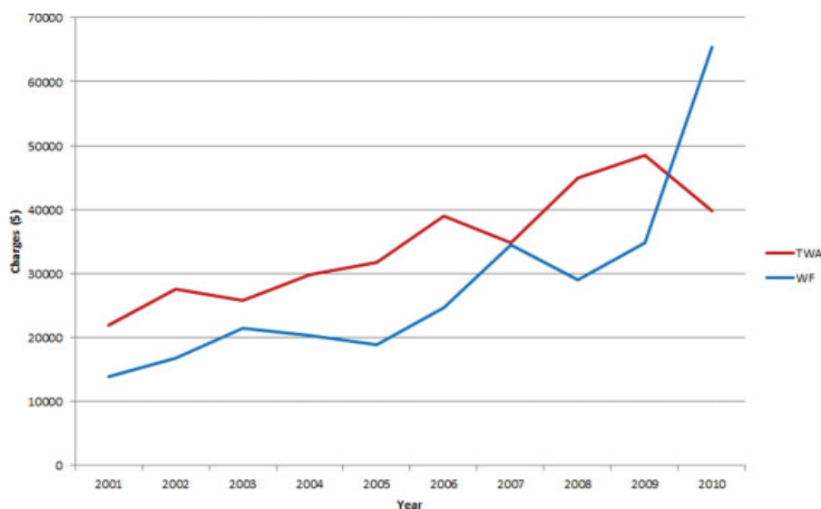
Fig. 4 Cost of hospitalization for TWA and WF.