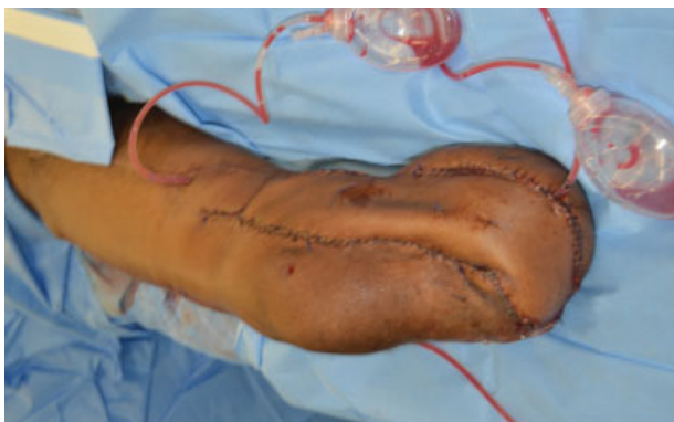
Fig. 3 Inset with anteromedial thigh component of the free flap covering the vein grafts to the superficial femoral artery and superficial femoral vein.

have reported successful prosthetic use with tibial stumps as short as 4 cm, 4 but short BKA stumps are less efficient during ambulation. 6 In order to optimize the patient's chances of efficient ambulation with a prosthetic, free tissue transfer was chosen.