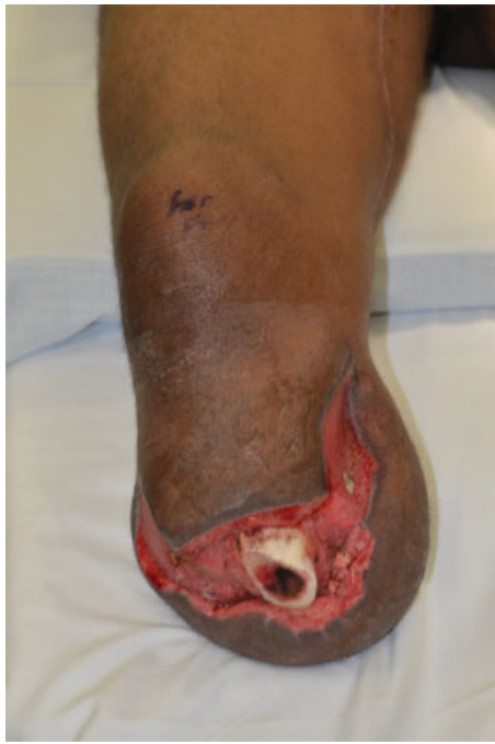
Fig. 1 Below-the-knee stump with exposed tibia.