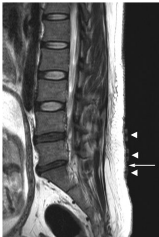
Fig. 2 Marking magnetic resonance images consisted of only T2-weighted sagittal images taken after attaching fiducial markers on the patient's lower back (white triangles). To enter the L5–S1 interlaminar space vertically from the skin, a mid-point between middle and lower fiducial marker (marked by white arrow) was selected for the skin entry point.

scale (VAS) pain score of the leg was 9/10. The immediate postoperative VAS pain score improved to 3/10. An ultrasound examination was performed to determine the status of the fetus 2 days after the surgery. The obstetrician confirmed that the baby was healthy.