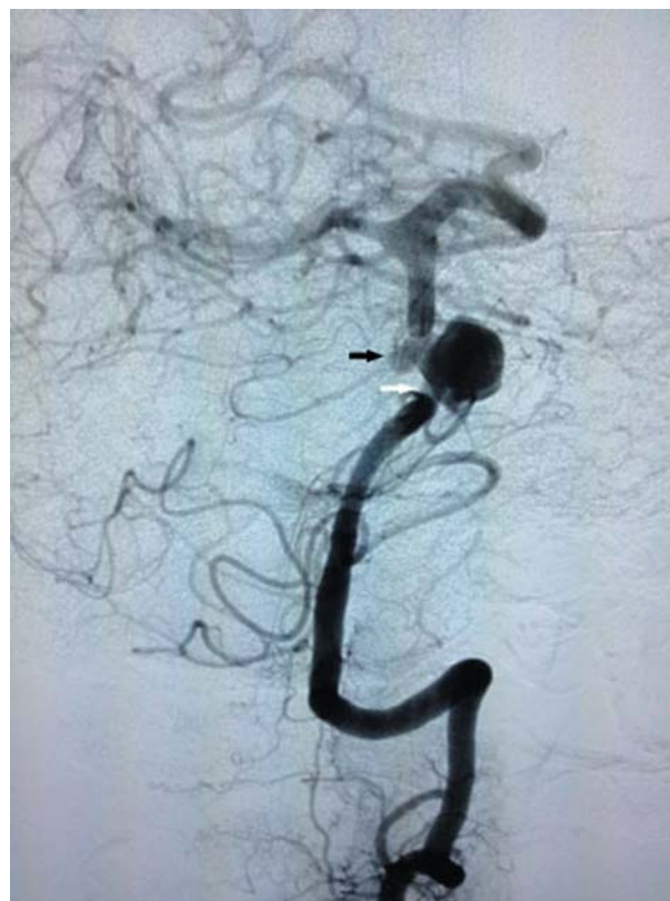
Fig. 3 Selective angiography of the left vertebral artery (oblique position) — small focal dilation in the origin of the right anteroinferior cerebellar artery (dark arrow), adjacent to segmental stenosis (white arrow).

et al 3 performed a study with 21 cases of BAD. In 10 patients (47.6%) there was rupture, and this was associated with a worse prognostic factor, with a mortality rate of 30% when compared with cases in which there was no rupture, with a zero-mortality rate. These same researchers showed that the group that was treated by the endovascular technique had a favorable outcome when compared with the conservatively managed group (90.9% favorable outcome for the group treated endovascularly compared with 50% for the conservatively treated group).