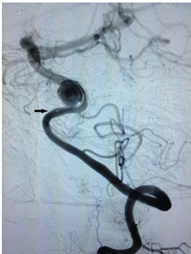
Fig. 2 Selective angiography of the left vertebral artery (side position) — image compatible with intraluminal flap (arrow).