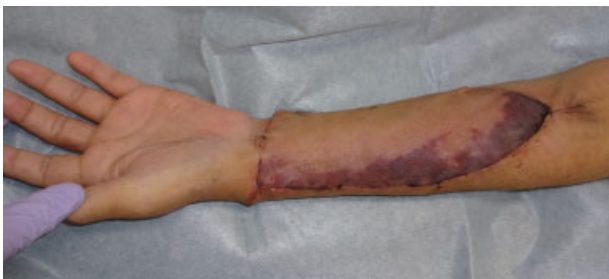
Fig. 1 Partial skin necrosis along the lateral side of the flap in V–Y flap closure.

The free radial forearm flap remains a workhorse flap for head and neck reconstruction, although perforator flap or super microsurgery has become increasingly popular. Yet donor-site morbidities, including unsightly appearances that may occur when sites are closed via skin graft, cause reconstructive surgeons to be hesitant to use the forearm flap. Elliot et al (1988) reported the direct closure method for donor-site defects of the radial forearm flap using the V–Y flap, and several modifications have been reported based on their methods. 1–8 However, partial skin necrosis sometimes occurs along the lateral side of the flap even though the perforators from ulnar artery are preserved well, and this necrosis leaves ugly wide scarring on patients' forearms (►Fig. 1). To minimize these drawbacks, simple lazy S double-opposing rotation flaps were designed for the donor site of the radial forearm flap, and the donor-site defect was closed directly. In this report, the details of the method and the outcomes are described.