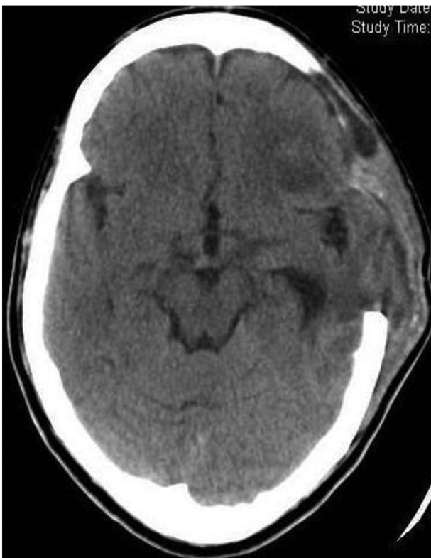
Fig. 3 Postoperative computed tomographic scan of the brain: resolution of the mass effect.

Mosquera et al reported cerebrovascular complications in only 8 patients (2.6%) of which 7 patients had cerebral hemorrhages. 4 Coagulopathy and intracerebral hemorrhage was reported in an 85-year-old woman attacked by a serpent of Elapididae family ( Notechis scutatus ). 5