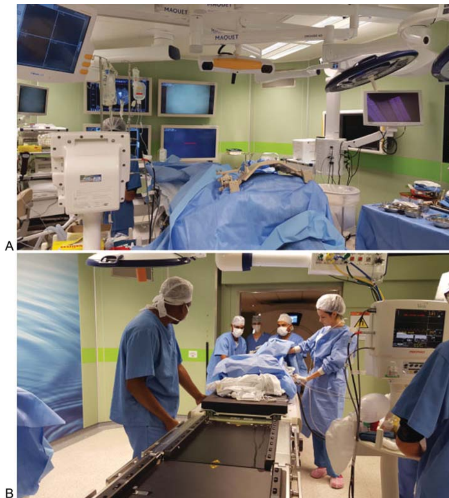
Fig. 1 (A) Surgery in the hybrid room, preparing the patient for intraoperative magnetic resonance imaging, with neuronavigation. The surgical site is covered with new sterile fields, the coils are coupled, as well as the device for immediate neuronal navigation with the new images to be obtained. (B) With the attached room door open, the special magnetic resonance transport stretcher is connected to the surgical table for direct transport of the patient to the apparatus by sliding.

pressure (ICP), partial tissue oxygenation (PTiO 2 ), point of care ultrasonography and pulse contour cardiac output (PiCCO) monitoring. Equally important is the presence of active teams of respiratory, motor, and day and night phonocardiography.