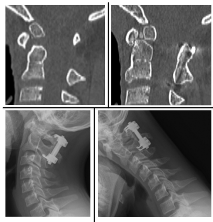
Fig. 3 At the 2-year follow-up, bone formation at the gap of the dens, which has been generally considered as pseudoarthrosis, was found after bony union of the posterior element of C1–C2 occurred.

To confirm whether the device fits the pediatric cervical spine correctly, we recreated a full-scale replica of the patient's C1–C2 preoperatively using a three-dimensional