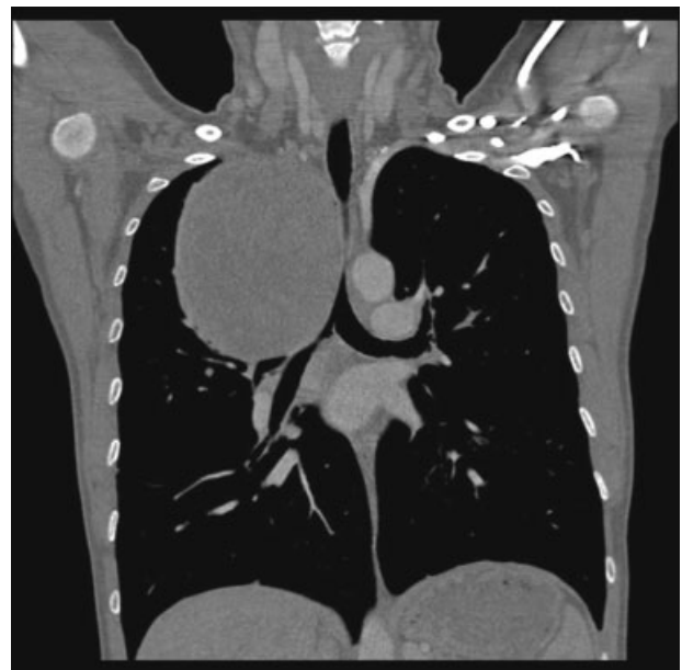
Fig. 2 Mass located in upper mediastinum.