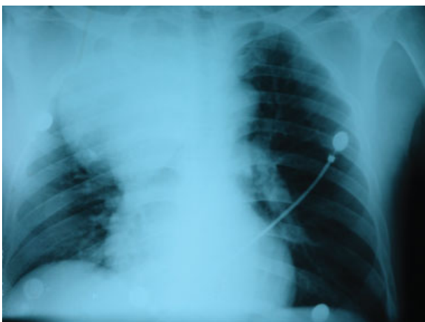
Fig. 1 Hematoma in thorax.

There was no clear examination findings but respiratory problems were evident in cases 3 and 4 (►Figs. 2, 3). In the third case, the patient was examined by chest physicians, and thoracentesis was applied for pleurisy but it caused pneumothorax, because the doctor asked for echocardiography (ECHO) instead of CT. ECHO showed that the mass was not cardiomegaly, and the patient was transferred to the radiodiagnostic department for diagnosis.