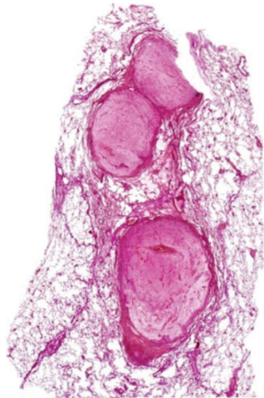
Fig. 3 Histological section of the myxoid tumor mass (EVG-stain, threefold enlargement), with canaliculary expansion inside the pulmonary vessels, spindle-cell formation with fibroelastic components. EVG, Elastic Van Gieson.

cycles of ifosfamide and etorubicin was initiated due to positive resection margin at the pulmonary artery (R1). After 1 year of follow-up, the patient is in a good clinical condition and tumor free, without signs of relapse. Under regular CT monitoring (every 6 months) he now receives a maintenance treatment with trofosfamide.