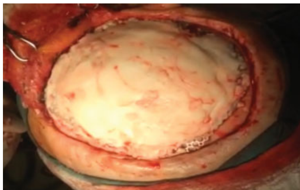
Fig. 3 Cranioplasty of a large cranial defect using PMMA prosthesis combined with a titanium mesh to confer bigger resistance.

The first synthetic plastic used in cranial reconstruction was celluloid in the late 19th century. 10 However, due to limitations related to the fact that this material elicits an intense inflammatory tissue response that leads to the formation of an exudate requiring reoperation, its use was restricted, and celluloid lost space to acrylic resins after their emergence in the 20th century. Nevertheless, plastic materials are still used in cranioplasty. Currently, the main representatives of this group are PEEK and polyethylene, which are durable, inert and non-degradable. Polyetheretherketone is a semi-crystalline polymer and was initially developed for use in spinal surgery and for the production of hip prostheses in 1998. 10 The use of PEEK as prosthesis for cranial defects has gained acceptance because it shows resistance comparable to that of the cortical bone, and is less dense and less conductive than other materials. Recently, technology has been developed based on computed tomographic images for the fabrication of custom-made 3D prostheses, optimizing the esthetic result. Despite these advantages, the material is expensive, and does not exhibit osteoconductive properties. Moreover, since it is a recent material, additional years of practical experience are necessary to demonstrate its long-term results in cranial defect reconstruction. 3,4,10