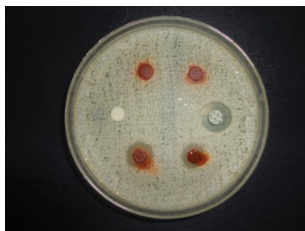
Fig. 2 Picture of the experiment: Sabouraud agar plate seeded with C. krusei , incubated at 37 \pm 2^\circ\text{C} for 24 hours; samples performed in duplicate. Disk no. 1: blank disc without product, study control; disks no. 2 and no. 3: impregnated with S. terebinthifolius Raddi, no inhibition halo observed; disk no. 4: with 100 IU nystatin and inhibition halo observed, experiment control; and nystatin disks no. 5 and no. 6: impregnated with S. terebinthifolius Raddi, showing smaller inhibition halo.