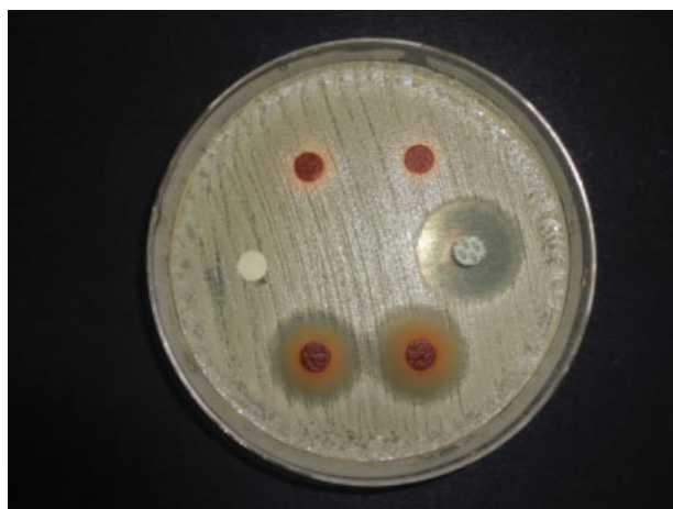
Fig. 1 Picture of the experiment: Sabouraud agar plate seeded with C. albicans , incubated at 37 \pm 2^\circ\text{C} for 24 hours; samples performed in duplicate. Disk no. 1: blank disc without product, study control; disks no. 2 and no. 3: impregnated with S. terebinthifolius Raddi, no inhibition halo observed; disk no. 4: with 100 IU nystatin and inhibition halo observed, experiment control; and nystatin disks no. 5 and no. 6: impregnated with S. terebinthifolius Raddi, showing smaller inhibition halo.

►Table 2 shows the comparisons at 24 hours of the different samples of the aqueous extract of S. terebinthifolius Raddi, nystatin, and the association of nystatin + aqueous extract of S. terebinthifolius Raddi relative to the CA and NCA strains; the results were significant ( p < 0.05 ).