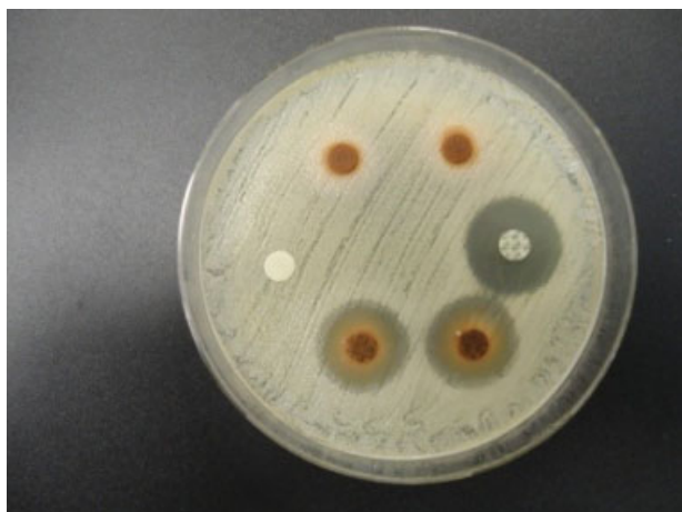
Fig. 3 Picture of the experiment: Sabouraud agar plate seeded with C. glabrata , incubated at 37 \pm 2^\circ\text{C} for 24 hours; samples performed in duplicate. Disk no. 1: blank disc without product, study control; disks no. 2 and no. 3: impregnated with S. terebinthifolius Raddi, no inhibition halo observed; disk no. 4: with 100 IU nystatin and inhibition halo observed, experiment control; and nystatin disks no. 5 and no. 6: impregnated with S. terebinthifolius Raddi, showing smaller inhibition halo.