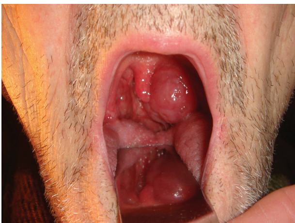
Fig. 1 Unilateral tonsillar hypertrophy in diffuse large B cell lymphoma.

Oral lymphomas occur more frequently in patients with HIV infection. Typical symptoms include oral swelling, pain, and ulcers. These lymphomas may present as a tumor or ulcerated lesion located anywhere in the mouth, but especially the gingivae, palate,