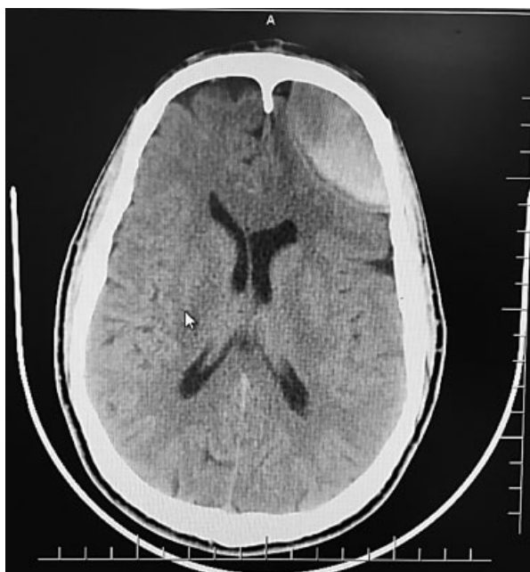
Fig. 2 Computed tomography of the head seven days after trauma.

Erdogan et al 2 reported rapid ossification of an EDH appearing in an 8-year-old boy, which occurred 10 days after a head trauma. De Oliveira et al 3 reported a 12-year-old boy who had a large chronic EDH with calcification 1 month after a mild head injury. Yu et al 4 reported a 26-day-old female infant who had a chronic EDH with a thick layer of calcification. Thus, most papers have been presented in pediatric patients. Seyithanoglu et al 5 reported that a 17-year-old girl with hydrocephalus was treated with a ventriculoperitoneal shunt and was found to have a bifrontal calcified EDH after 3 years.