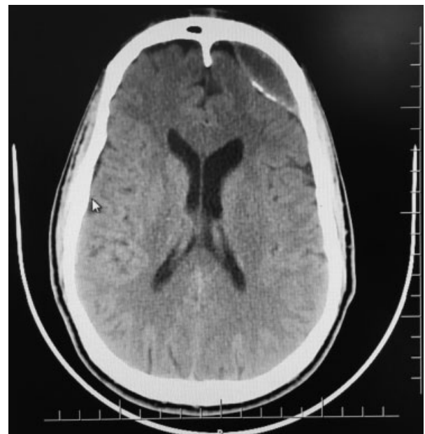
Fig. 4 Computed tomography of the head 1 month after the trauma showed resolving epidural hematoma, with thickened calcified inner layer.