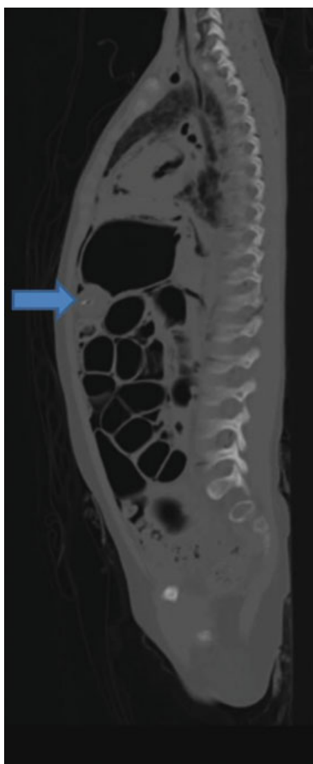
Fig. 4 An 8-year-old girl died of peritonitis after malpositioning of a gastrostomy feeding tube into the peritoneal cavity. The postmortem computed tomography demonstrates the balloon of the MIC-KEY just outside the stomach (arrow).

study, as the initial gastric content aspiration indicated correct placement. The girl was discharged after an hour without pain or discomfort and with clear instructions to the parents. In the following days, the tube tract seemed slightly painful. Parents gave medication and tube feeding without problems or complaints. After 48 hours of placement of the MIC-KEY, the girl was found dead in her bed while lying in vomit. The parents consented to postmortem CT and full body autopsy. The CT demonstrated a malposition of the MIC-KEY just outside the stomach, with extensive intraperitoneal free gas and fluid with high radiodensity suggestive of perforation and leakage of enteral feeding and peritonitis. (→ Fig. 4) Autopsy confirmed these findings as well as a perforation in the skin-to-stomach fistula. Food and medicines were found in the peritoneal cavity with diffuse peritonitis. The cause of death was peritonitis due to MIC-KEY gastrostomy feeding tube perforation.