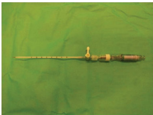
Fig. 1 Turkel Safety thoracentesis and paracentesis system of Covidien.

as a last attempt, despite the expectation of only marginal improvement, another chest drain (same type) was placed. While placing the chest drain, fresh blood came out of the drain. Without any further alternative treatment options, the boy died within minutes. The parents consented to postmortem imaging but not an autopsy or any other invasive procedure.