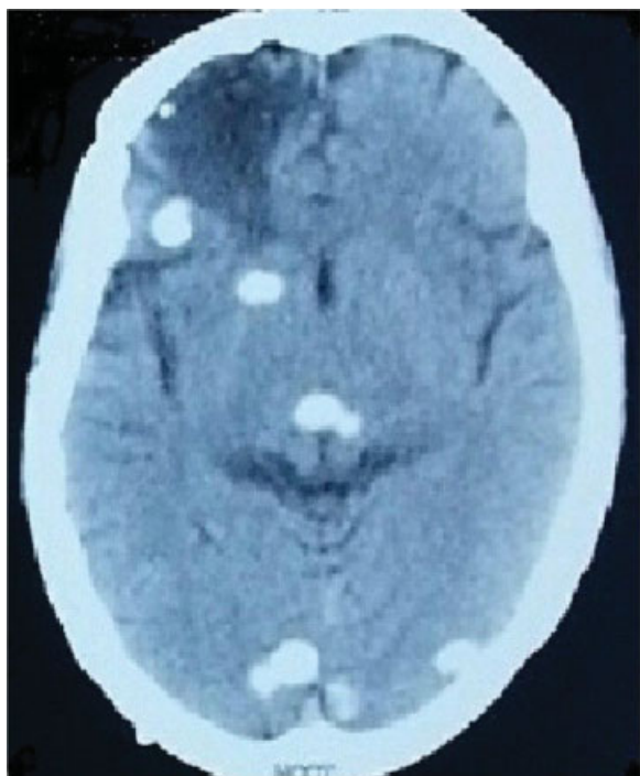
Fig. 4 Postoperative cranial computed tomography scan after excision of right frontal tuberculoma still showing presence of right frontal, thalamic, and occipital lobes.

are seen in approximately 5 to 10% of tuberculosis cases. The intracranial tuberculoma account for 5 to 30% of all intracranial space-occupying lesions in developing countries. 1