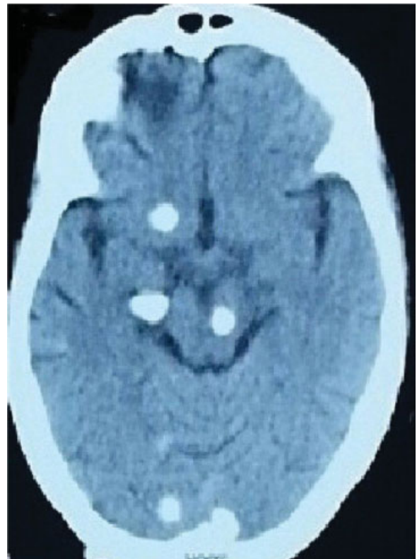
Fig. 3 Postoperative computed tomography scan of head at follow-up period after 15 years following craniotomy and resection of right frontal calcified tuberculoma in brainstem, and supratentorial compartment.

These CNS involvements such as meningitis, solitary tuberculoma, abscess, infarct, or miliary parenchymal lesion