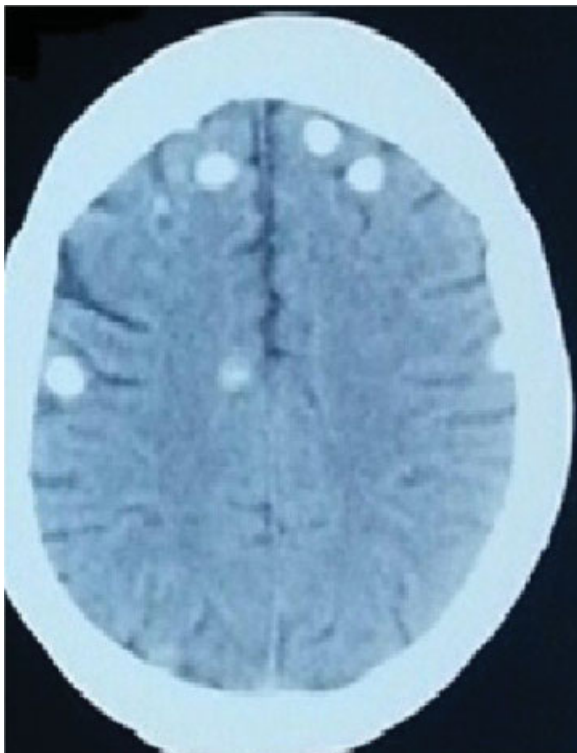
Fig. 2 Cranial computed tomography scan of head showing presence of multiple calcified lesions in the bilateral frontal and parietal region in the supratentorial compartment (preoperative scan).

tuberculoma excision surgery, she had no focal neurologic deficit. The cranial CT scan at the present follow-up revealed presence of multiple intracranial tuberculoma. Although the sizes of the multiple lesions were slightly reduced, still considerable sizes are persisting (–Figs. 3, 4),