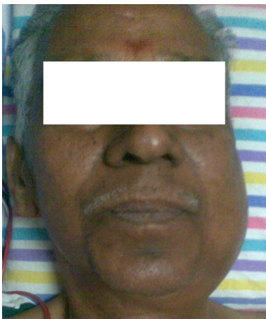
Fig. 1 Photograph of the patient's face showing the ipsilateral (left) parotid region swelling.

and he was managed conservatively. A magnetic resonance imaging with magnetic resonance angiography (MRA) confirmed the findings (► Fig. 4 ). In addition, there was also diffuse soft tissue swelling in the left upper neck, especially in the tonsillar region. The swelling was stable and gradually reduced by the next day. Within 3 days, there was significant reduction of the swelling.