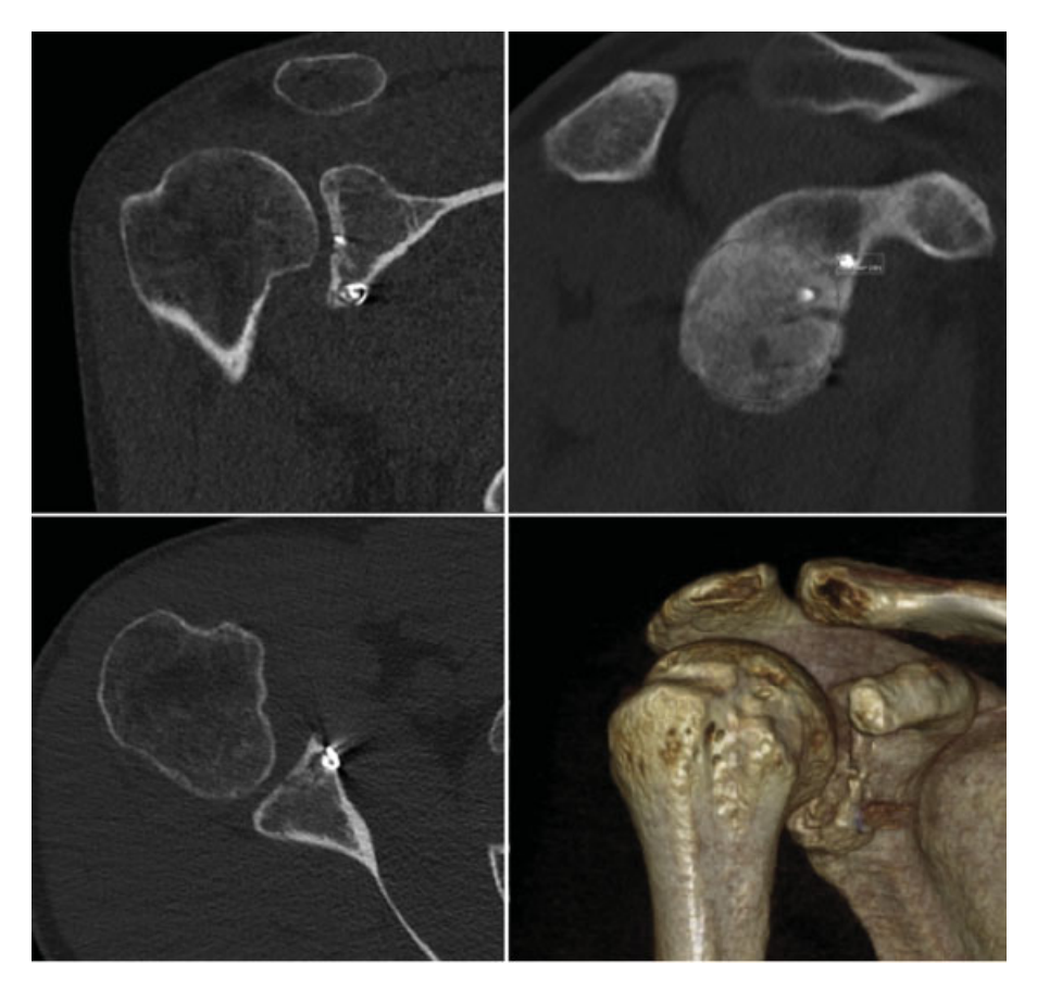
Fig. 2 Postoperative CT scan and 3D reconstruction at 6 months. 3D, three-dimensional; CT, computed tomography.

radiographs showed no displacement of the fracture. No limitations regarding passive movement were prescribed after immobilization, and the patient was subsequently allowed to regain full elevation and external rotation.