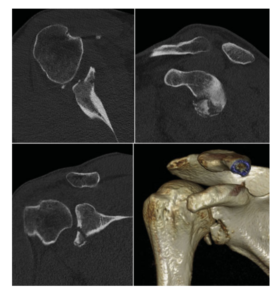
Fig. 1 Preoperative CT scan and 3D reconstruction. 3D, three-dimensional; CT, computed tomography.

displaced glenoid fracture corresponding to roughly 30% of the glenoid surface ( > Fig. 1 ).